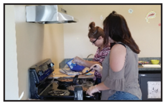
Creating "Family" meals provides students with a sense of support and worth.

Parents work with the staff to ensure student success. Weekly communication with the parents and triennial meetings are held to confirm the partnership. Text messages or emails are sent to parents daily about work completion.