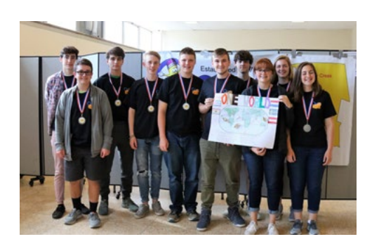
Central Square School District takes second place.