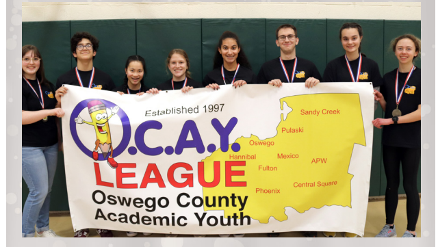
Oswego receives silver medals.