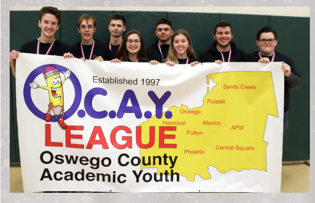
Central Square receives gold medals.

The third Oswego County Academic Youth League featured a series of academic activities ranging from short quizzes to a jigsaw puzzle. The objective of the competition was to complete as many challenges as possible in the designated time period.