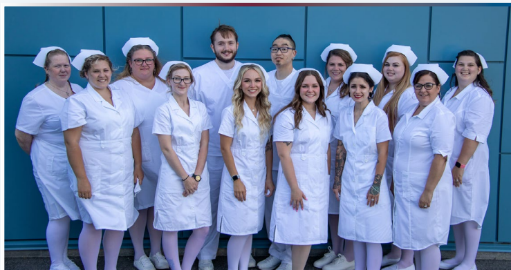
CiTi Practical Nursing graduates pictured above.

The Center for Instruction, Technology & Innovation congratulated six new Dental Assisting graduates and 13 Practical Nursing graduates at recent graduation ceremonies.