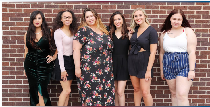
CiTi Dental Assisting graduates pictured above.