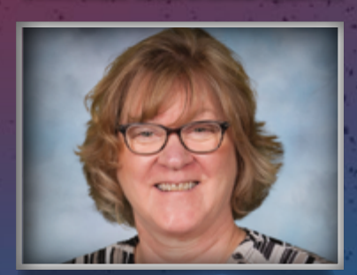
ROBYN PROUD CARE and CARE PLUS